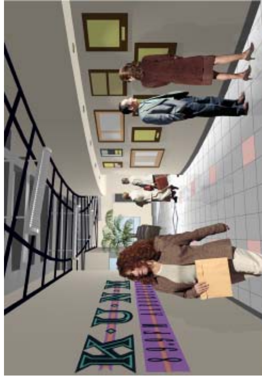
KUNM Radio Station Remodel

Your gift will help us earn a $100,000 matching grant from The Lannan Foundation in Santa Fe. And, you could win an iMac computer from Baillio's! Details inside.