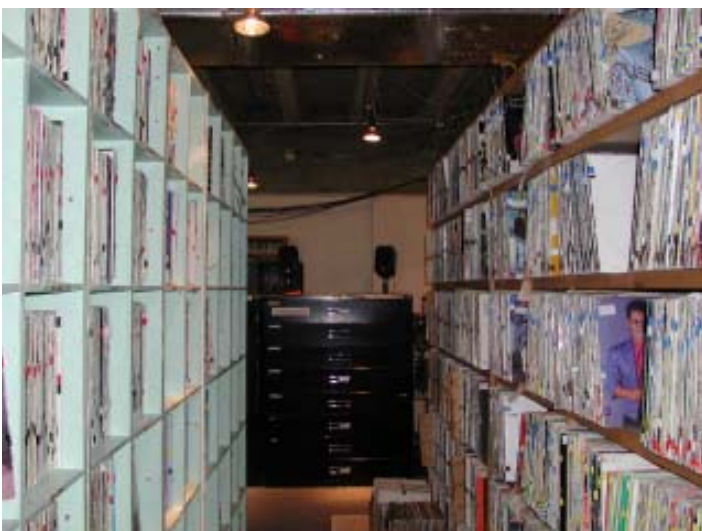
KUNM's music library is temporarily housed in what will eventually be the new News Department.

Production team to move into the new News Department while the old Production Department offices get “unified” with lots of muscle behind 15-pound sledge hammers. The News Department moves into the News Department at the end of September or in early October. This renovation game of “hide and seek” goes on until December and will impact our offices for engineering, development, administration, operations, and online services. Indeed, everything will change.