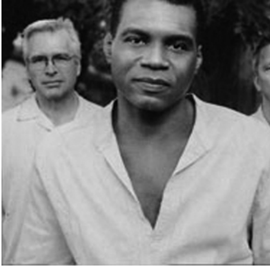
Robert Cray

10 p.m. Southwest Stages. An Evening with Robert Cray, recorded live at the Telluride Blues & Brews Festival in Telluride, CO in 2005.