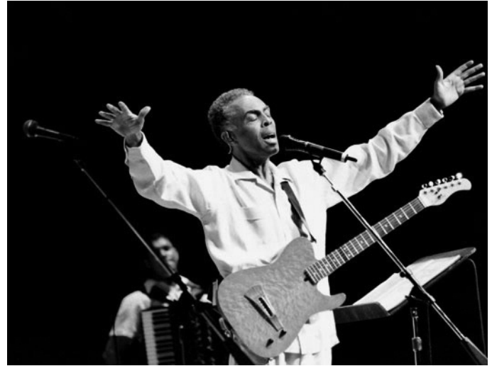
Gilberto Gil

10 p.m. Afropop Worldwide. A Celebration of the 60th Anniversary of the U.N.'s Universal Declaration of Human Rights. On this special edition, cutting edge African and Diaspora artists—Emmanuel Jal from Sudan, K'Naan from Somalia, Angélique Kidjo from Benin, Gilberto Gil from Brazil and others—celebrate the landmark affirmation of human rights launched in 1948 in the wake of World War II. The artists share their thoughts and feelings about the fight for human rights in their countries and around the world, and share their songs