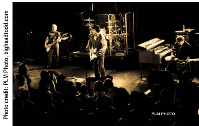
Big Head Todd and the Monsters

10 p.m. Southwest Stages. An Evening with Big Head Todd and the Monsters, recorded live at the Lensic Theater in Santa Fe, NM in the Winter of 2005.