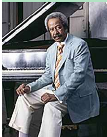
Alan Toussaint

10 p.m. Beale Street Caravan. Alan Toussaint. Producer, songwriter, arranger, session pianist, solo artist -- Allen Toussaint has worn all these hats over the course of his lengthy and prolific career, and his behind-the-scenes work alone would have been enough to make him a legend of New Orleans R&B. Thanks to his work with numerous other artists, Toussaint