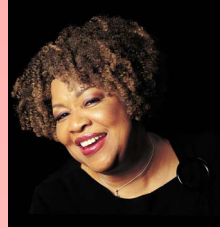
Mavis Staples

10 p.m. Beale Street Caravan. Mavis Staples. Born in 1940 in Chicago, most of Mavis Staples' career has been as lead singer for the legendary Staple Singers. She first recorded solo for the Stax Records subsidiary, Volt, in 1969. Staples has a rich contralto voice. Her otherworldly power comes instead from a masterful command of phrasing and a deep-seated sensuality expressed through timbre manipulation. Both the Staple Singers and Mavis found fresh