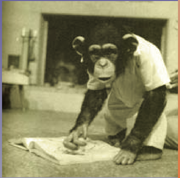
Lucy , airing April 11

The "Lab" returns Sunday, April 4 at 11 a.m. Plus, get a glimpse of La Montanita's Earth Day Festival airing LIVE on KUNM. Details on page 9