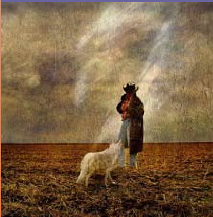
Animal Minds , airing April 4