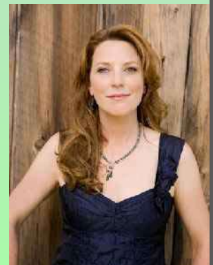
Susan Tedeschi

10 p.m. Beale Street Caravan. This week BSC has an entire hour-long program featuring Susan Tedeschi live on the Legendary Rhythm and Blues Cruise. Guitarist, singer and songwriter Susan Tedeschi is part of the new generation of blues musicians looking for ways to keep the form exciting, vital and evolving. Tedeschi’s live shows are by no means straight-ahead urban blues. Instead, she freely mixes classic R&B, blues and her own gospel and blues-flavored original songs into her sets. She’s a young, sexy, sassy blues belter with musical sensibilities that belie her years. The Susan Tedeschi Band’s first album, Just Won’t Burn , was released on the Boston-based Tone-Cool Records in early 1998. The band for her debut on Tone-Cool includes