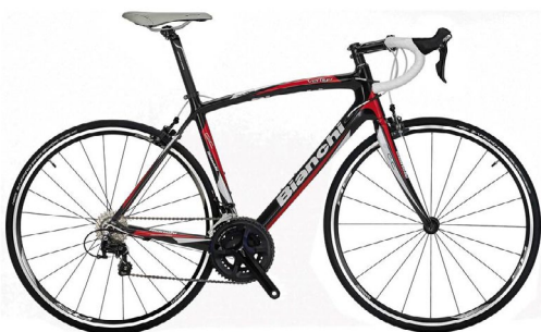
Bianchi Vertigo Value $1899